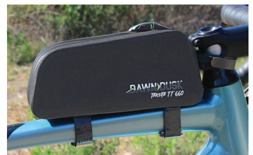
Top tube bag installation using straps