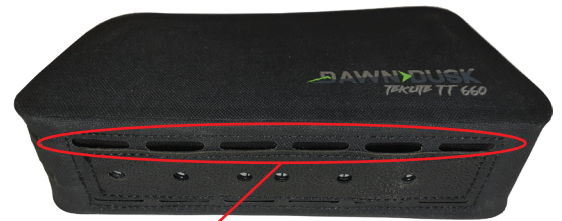
6 loops (3 sets)

Position the bag on a main frame tube where it will be safe, and where it will not interfere with any rotating or moving part of the bike. Wrap the strap around the tube and thread the end through the buckle. Pull the strap tight and push the hook end of the Velcro into the soft loop surface of the strap ensuring a secure fasten. Figures C & D.